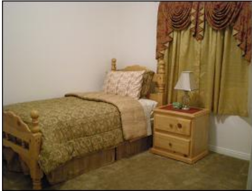
Private / Semi-Private Bedrooms